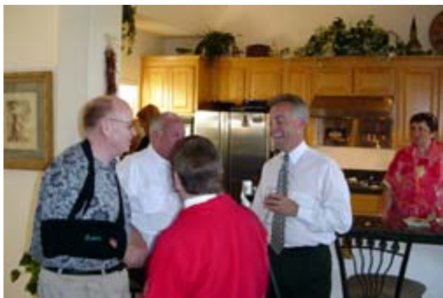
“You broke it how?????????”