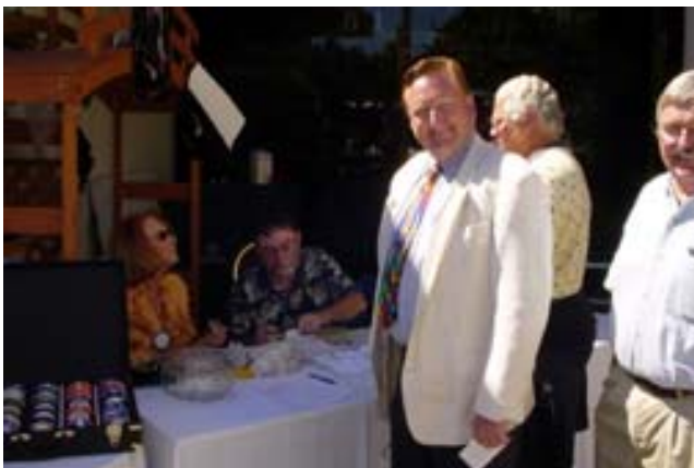
“Anybody seen my airplane?”