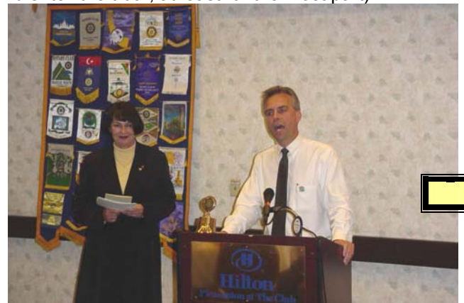
Woody gives away some of '02 Cabaret's proceeds

(Please submit critiques of any other club's meeting when you do a make-up, what you liked, what you didn't like, what they served, etc...A new Northwinds feature is brewing: Rotary Critics Corner. The only rule: tell the truth, at least for the most part)