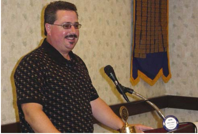
Why is this guy smiling? He's next!