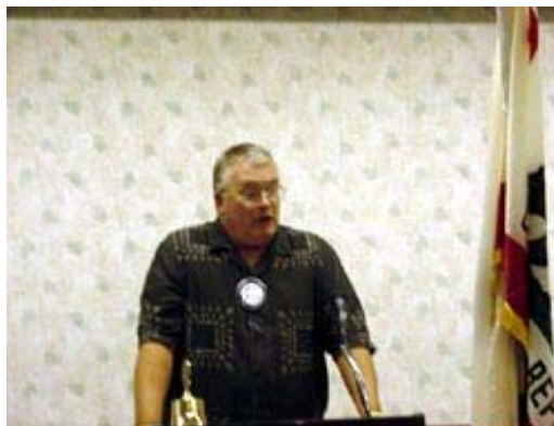
"It's not easy being Woody"