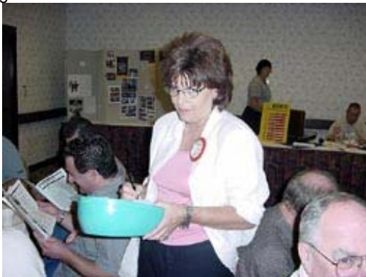
“you mean that you want me to collect money from them?”