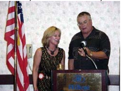
“Here is your red/blue badge & a $10 fine-be happy”