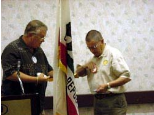
“And here is your new blue badge to replace your red badge, but you are still a red badger, just wearing a blue badge” HUH?