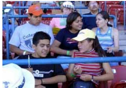
Can you believe that she really bet money on that old nag?