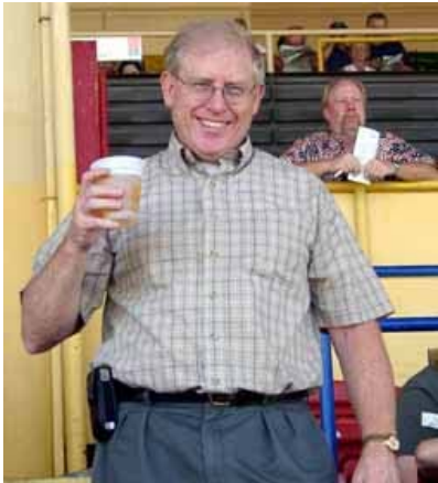
This is NOT the face of someone who is losing money!