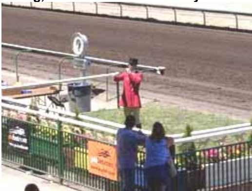
They were playing Woody’s song—it was wordless