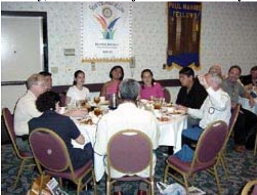
Hola, amigos de Mexico-Bienvenidos