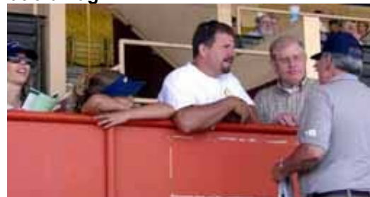
The high-powered betting consortium confers