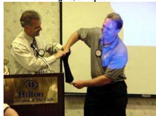
Fudd cast himself in a strange light as he tried for the black marble-no cigar for Fudd!