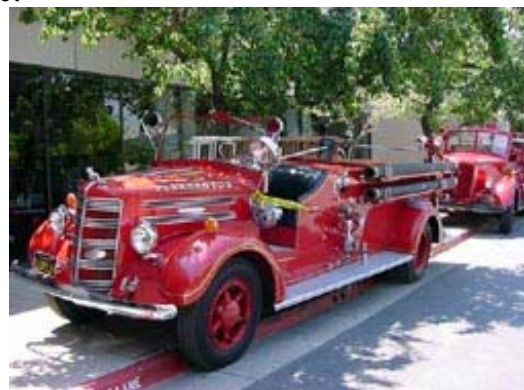
Old firefighters on Woody-alert