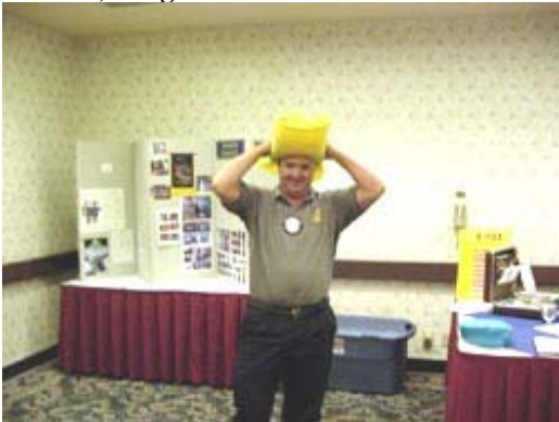
“I was wantin’ to wear this silly hat all last year and now I can-whoopee!”