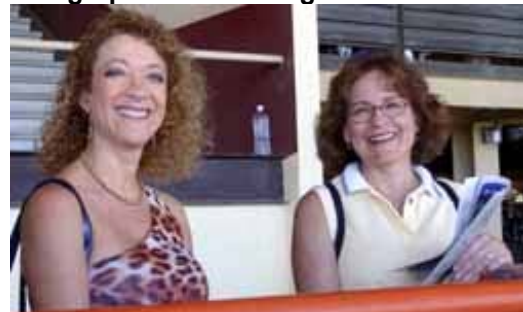
Hey, we don't bet. We just came here to look cute and watch other people