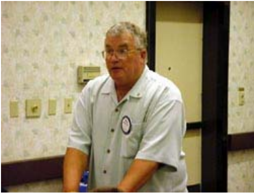
“Hey, one more bad joke never hurt anyone”