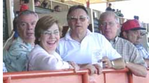
Just look at the other faces; shes’ not laughing because she won! No, she was the only one who didn’t bet this race.,