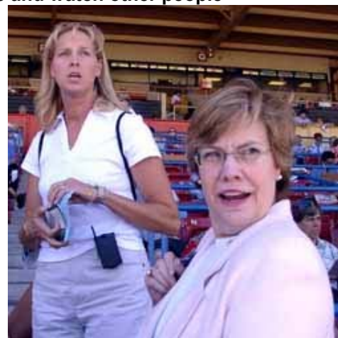
I believe that our horse stopped for a coke and pizza on the third turn"