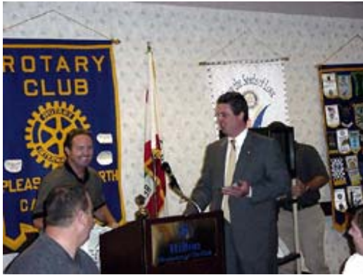
“When I say a little gift, I mean ‘little’”