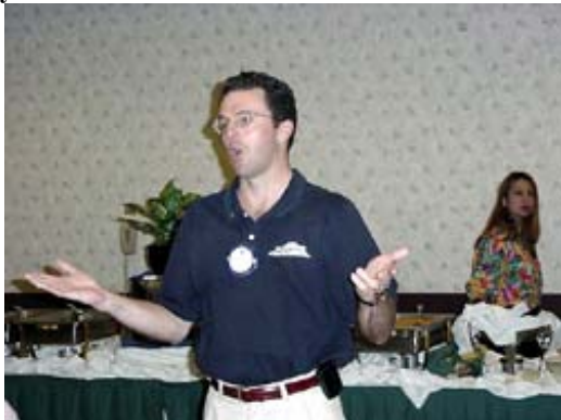
“What I take one lousy vacation and you fine me?”