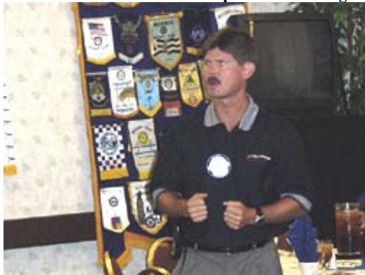
“Hey I never said this Poet Laureate stuff was easy”