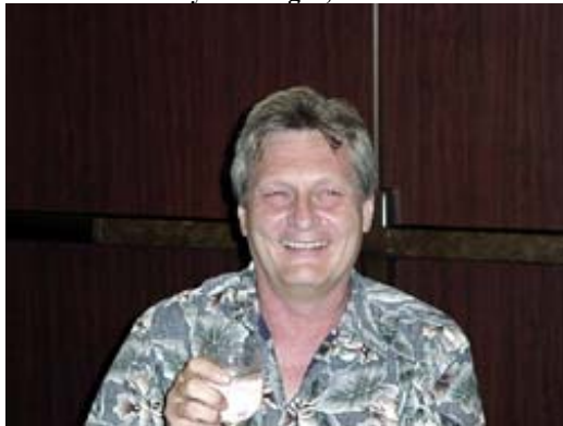
This man with milk is like the Pope with Chorus girls