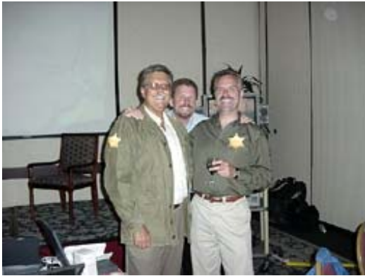
Despite the gravity of the evening's events, friends chose to have fun