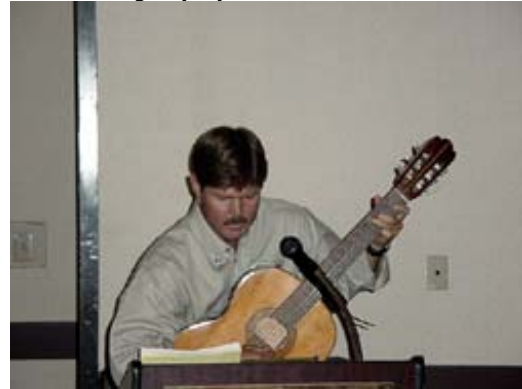
"If I had a hammer, I'd hammer on wabbit..."