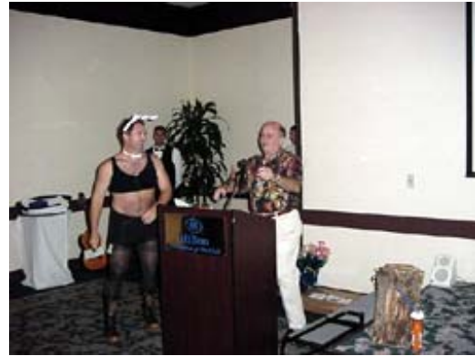
You can just call me bunny "Fudd for fun"