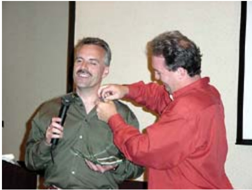
And the new President is pinned