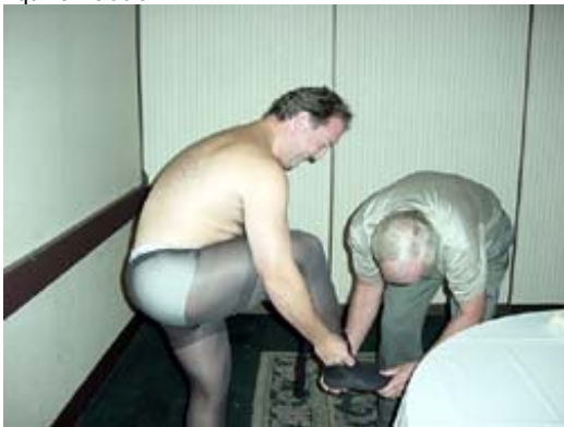
Wow! I never knew this panty hose could feel so good