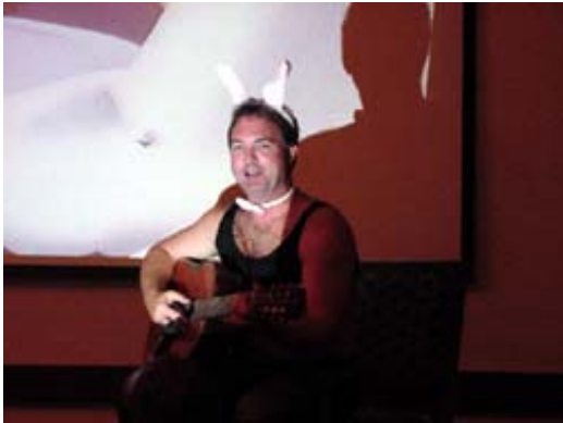
"I have always dreamed of being a torch singer"