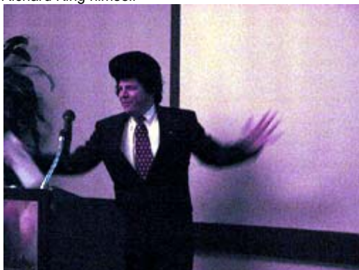
"Yes it is I-I-I-I...ah, Your Richard King-g-g-g-g-g-g! I have come to save the day-y-y-y-y! You can bow now"