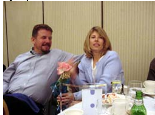
"I told you that the Fudd silent would be funny"