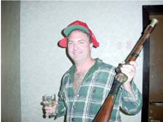
with this gun and a few more drinks, I know I can catch that wraskquwe wabbit