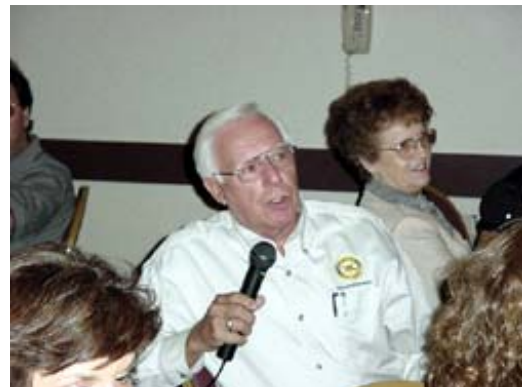
well Fudd, you certainly brought a different.....ah....dimension to the club's presidency"