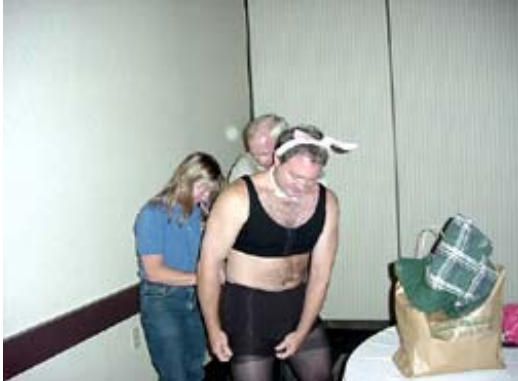
I wonder what the tolerance levels are on this spandex stuff?