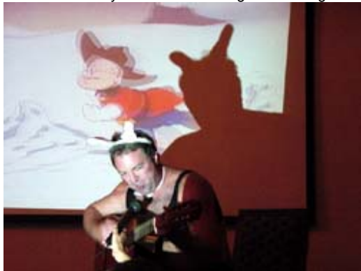
"If I had a hammer, I'd hammer on a wabbit..."