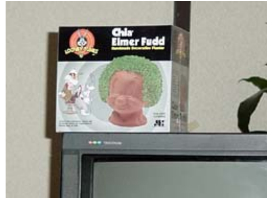
Oh good- just what we need, Fudd with Chia-breath