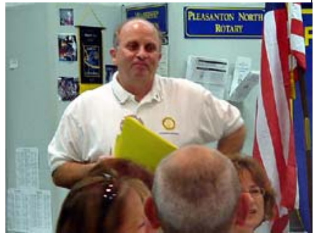
And if you guys really miss Yoda, I'll come back as your leader again-the force is with me?