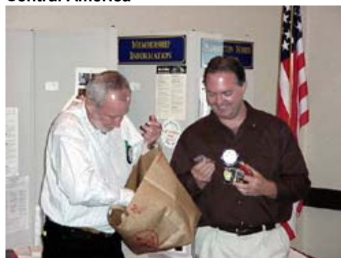
...and here is a beer holder....