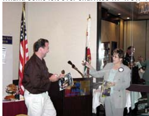
and here is a magazine, and a book....