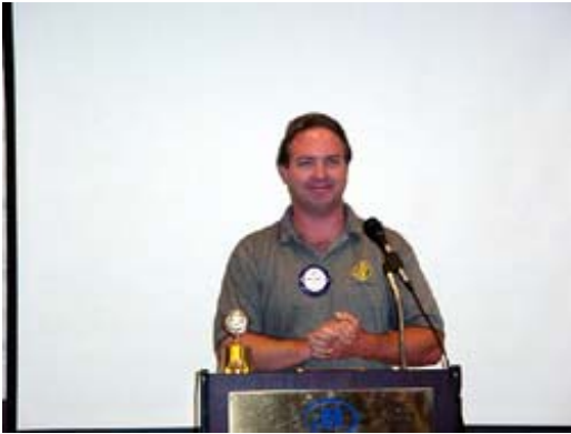
"I just be sooo pweased" said Fudd