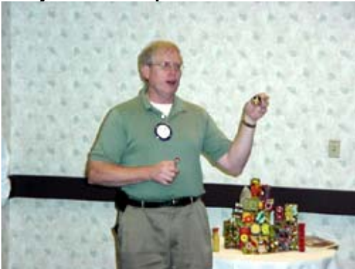
"And here is an official Mexican drinking cup"