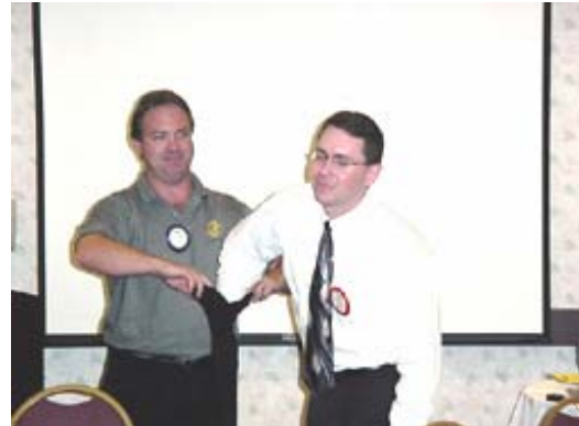
Close but no cigar!