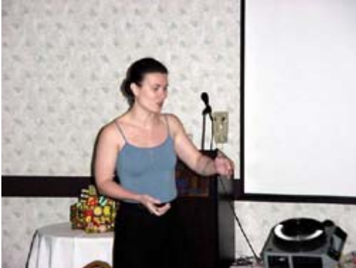
"Actually, trees really look good covered in pink sugar and frosting"