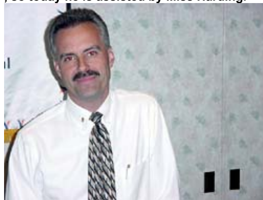
"Aw shucks, what can I say? WE did it!"