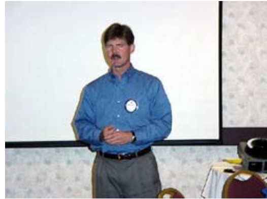
We can't really remember why he was up in front