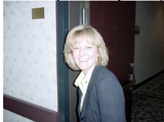
"Hi guys, yes the wedding was great!"