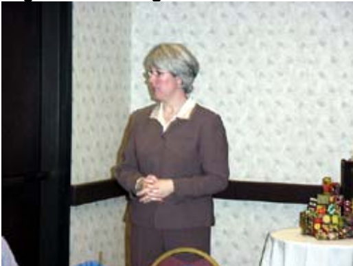
"we have many exciting summer programs