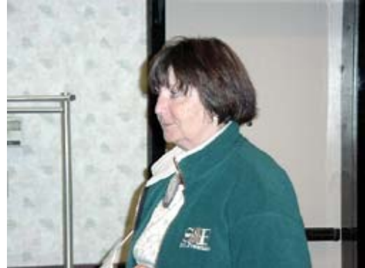
"I for one am glad this Cabaret is over-now I can rest"