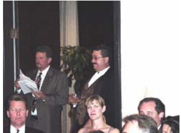
Man-o-man- look at the cash roll in. If I could only do this in my business, I could work less than I do now.