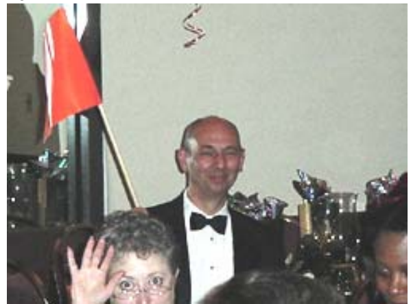
"Lady! Your supposed to use your bid number, not your hand to buy something"