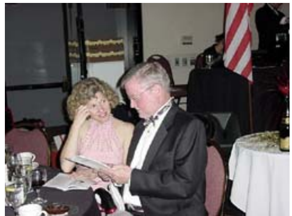
"Oh come on honey- won't you buy that little ol' dinner just for me?"