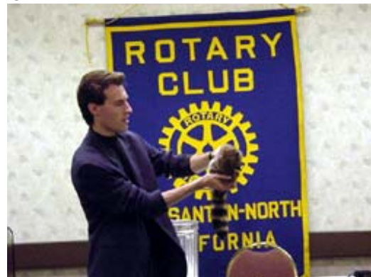
This is Rocky....He's pretty frisky