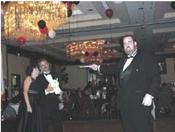
"OK sir, you have just purchased that woman for 15 pesos- congratulations, and don't tell Teddy."