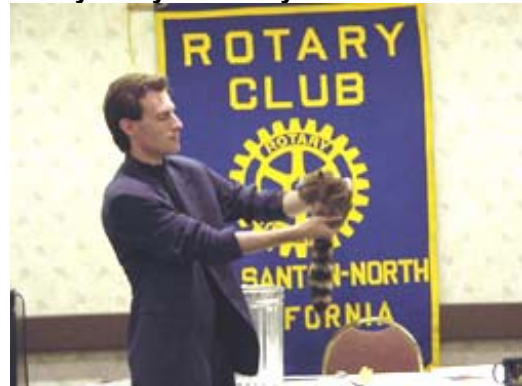
Rocky likes to dance and boy can he "rock"