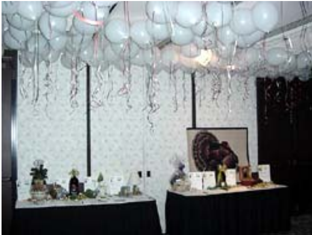
The white room had some awesome items