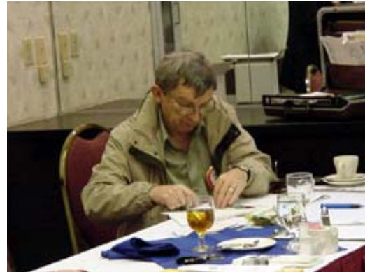
"lets see..8 take away 5, minus 2 plus three tickets is..?????"

Would it be a stretch to say that there was "magic" at this meeting? I don't think so!