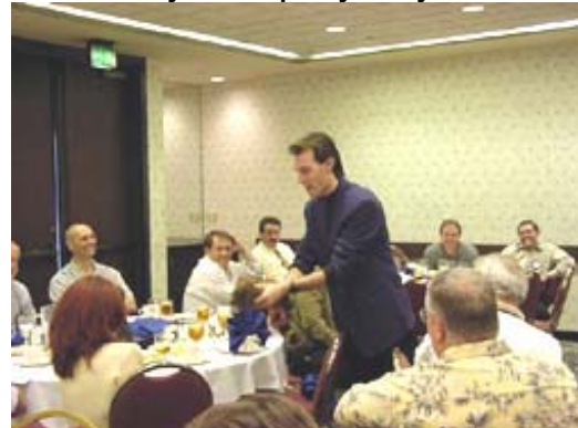
Rocky really likes foxy women-come back here!