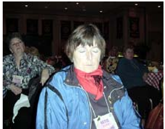
It's the altitude, puts me to sleep...