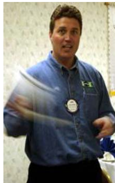
May the Force be with you!